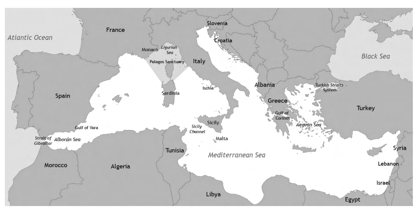
Fig. 2. Map of the Mediterranean Sea showing some of the locations cited in the text.

movements of some delphinids, leading to population structure. Further research is needed to characterise population structure of Risso's dolphins within the Mediterranean as well as the degree of genetic exchange with animals in the Atlantic. The species' failure to colonise the Black Sea could be explained by the lack of suitable habitat in the Turkish Straits system (Dardanelles minimum width about 450 m, sill depths less than 55 m) or, perhaps more importantly, by the remarkable absence of cephalopods (Nixon and Young, 2003; Jereb and Roper, 2005).