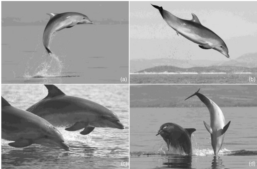
Fig. 1. These common bottlenose dolphins photographed in the eastern Ionian Sea show the characteristic morphology of the species: robust body, short beak, fading brown/grey coloration, white belly (occasionally pinkish), dorsal cape and flank stripes.