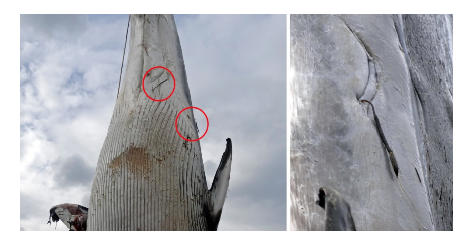
Figure 3. Pennella sp. on the minke whale.

Previously Öztürk et al. (2011) reported a stranding minke whale on the coast of Erdemli, Mersin in August 2005, which was the first case of the minke whale stranding on the Turkish coast. The location of the present case was very close to Erdemli, Mersin (Figure 1). There can be more strandings or even live